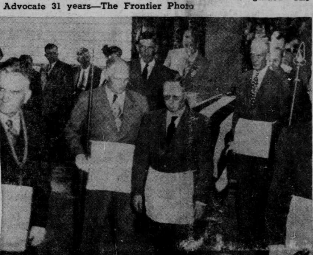
The casket is borne from the Ewing Methodist church . . . it was a Masonic burial rite.