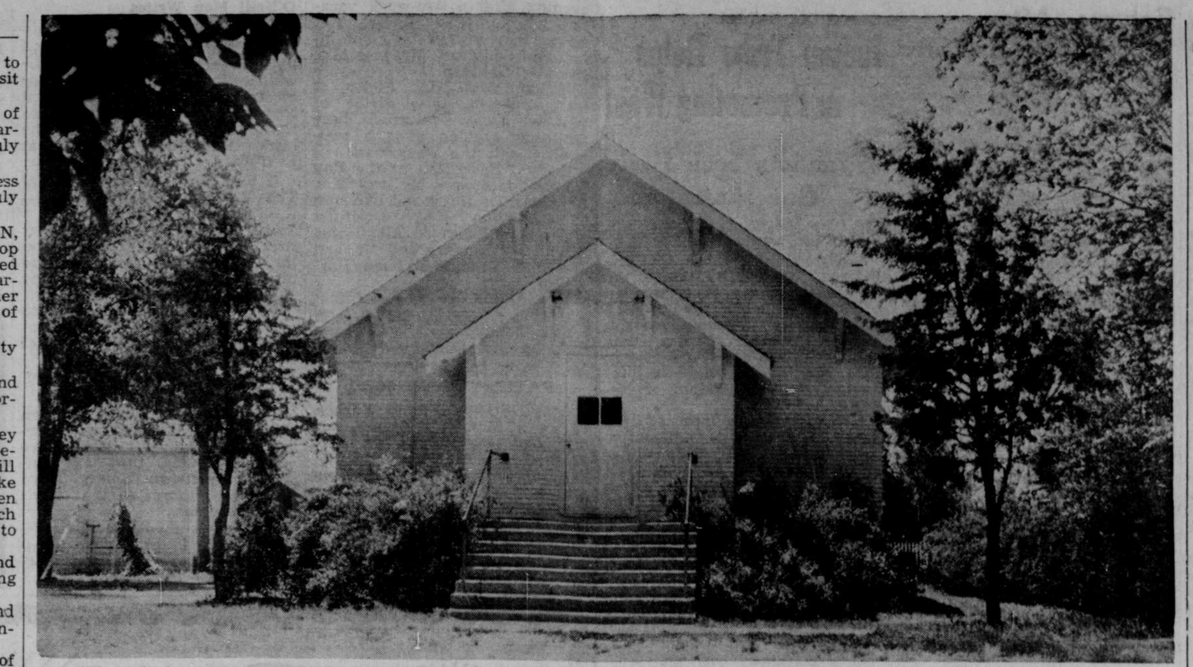
Wintertime scene (above) of Immanuel Evangelical Lutheran church in Atkinson. Interior view (below). On Sunday, July 27, the church will observe the 25th anniversary of its dedication.