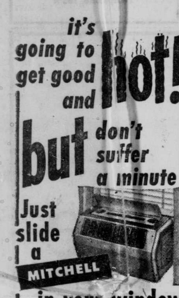
in your window

This means that the recipients of all assistance must pay the first $3 on each month's medical costs.