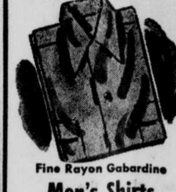
Men's Shirts 2.98

Dressy casual style with long sleeves, two-way collar. Many nice colors. Sizes S, M, ML, L.