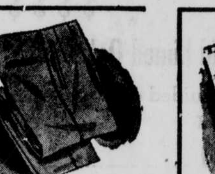
85% Rayon, 15% Nyion Gabardine Slacks 8.50 to 13.50

The thrifty choice for rugged outdoor wear; low priced, give long service. Durable rubber soles and heels, plain toes. Sizes 10 to 3.