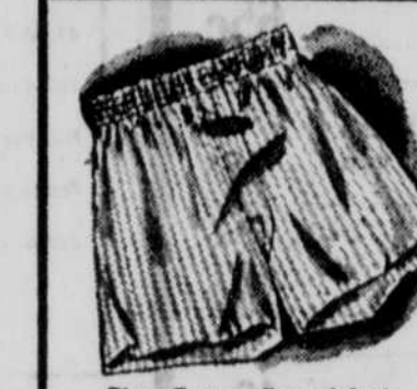
Men's Shorts 69 c

To dramatize your favorite skirt or suit! Sweetheart or jewelry neckline styles . . . both with short sleeves. White, pink, aqua, maize.