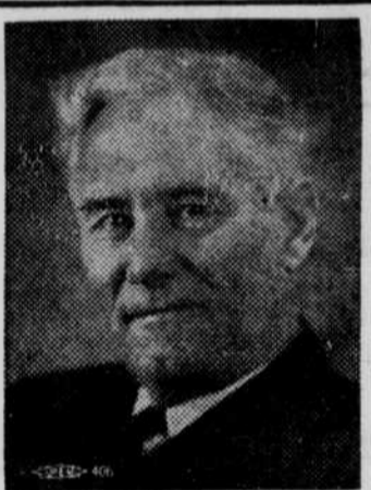
Senator Hugh Butler

McCook, Neb.—"No man ever made a greater sacrifice for Nebraska" than Senator Hugh Butler did during the 80th Congress, when he turned down the chairmanship of the Senate Finance Committee.