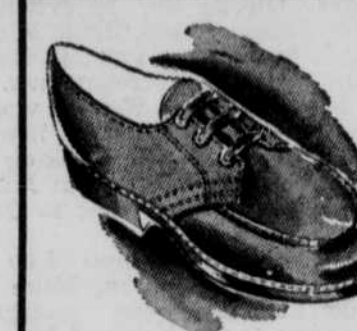
Mahogany Color Leather Men's Oxfords 5.75

Elastic top style in fast colors. Men's sizes 10-13, boys' sizes 7-10½ at this low price!