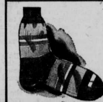
Gay Blazer Stripes Cotton Socks 29c pair

Elastic top style in fast colors. Men's sizes 10-13, boys' sizes 7-10½ at this low price!