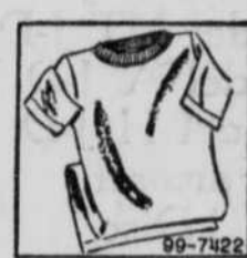
Boys' T-Shirts 59c

Popular style in tan or brown. Cotton gabardine with all leather sweatband. 6¾-7½.