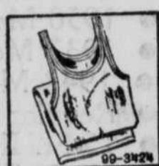
Athletic Shirts 59c

Fully cut for comfort, fine ribbed knit neck. White knit combed cotton. Boys' sizes 6-16.