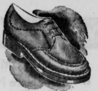
Antiqued Burgundy Elk Boys' Oxfords 5.50

The shoe with the last that follows the natural shape of the foot. The Goodyear welt construction helps these shoes keep their shape longer, makes them more durable. Long wearing oak soles and rubber heels.