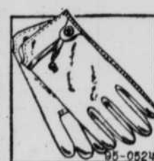
Men's Gloves 2.19

Sturdy 10-ounce white canvas. Soft inside nap, double knit wrists. Long wearing! Men's sizes.