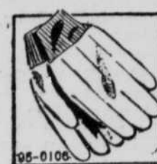
Work Gloves 35c Pr.

Roomy moccasin vamps and foot loes accented with stitching! Sturdy rubber soles, 2½-6.