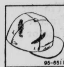
Gabardine Caps 98c

Genuine buckskin that's soft and pliable, yet very durable. Adjustable wrist straps. S,M,L.