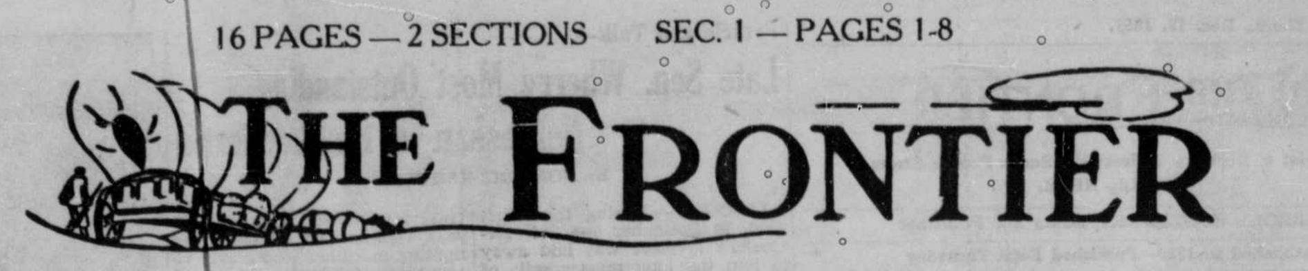
North-Nebraska's Fastest-Growing Newspaper

The problem of teacher retirement has to do with putting the stricken with a heart attack. His machine veered off the