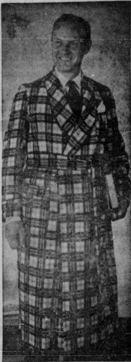
FASHIONABLE INDEED... That will be dad on Christmas morning, if among his gifts is one of the new robes. This one is of lightweight virgin wool in smart and popular Scotch-tartan pattern.