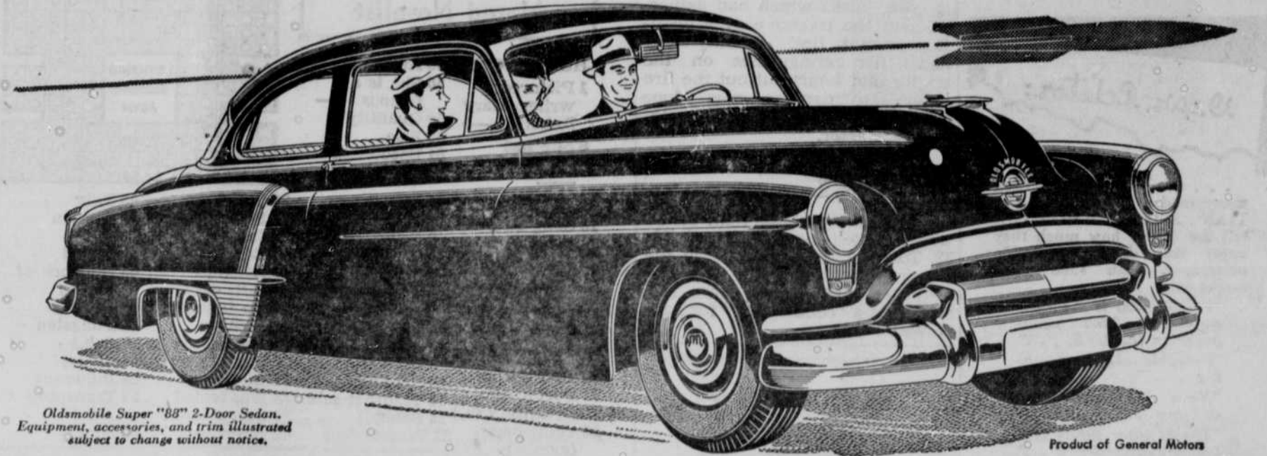
Oldsmobile Super "88" 2-Door Sedan. Equipment, accessories, and trim illustrated subject to change without notice.

FIRST TWELVE YEARS AGO... STILL FIRST TODAY!