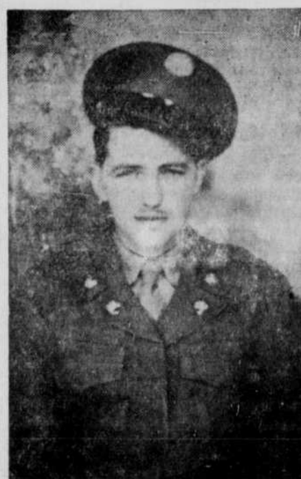
—The Frontier Engraving