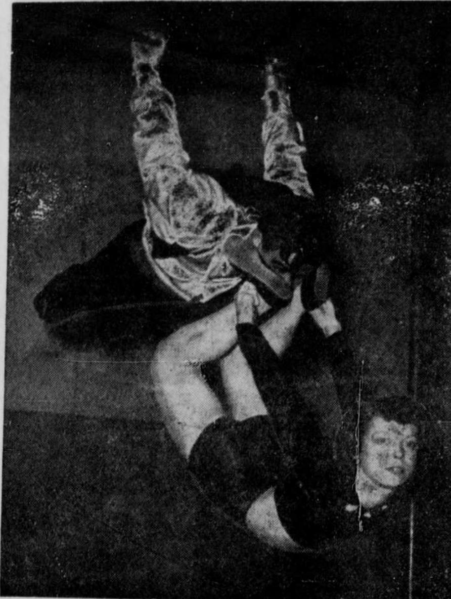
'SWINGING SENSATIONS' COMING . . . Two performers, a man and a girl known as the 'Swinging Sensations' will appear in grandstand performances Friday and Saturday nights, August 31 and September 1, at the 59th annual Holt county fair. She is the only girl in show business who actually does horizontal bar routines.