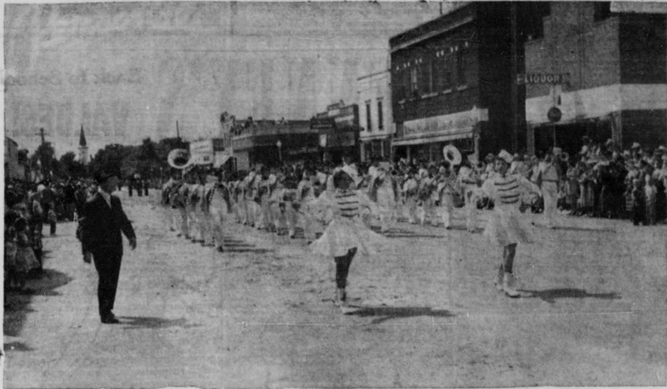
The white-uniformed Stuart high school band is pictured moving east on Atkinson's State street as a portion of the famous hay days