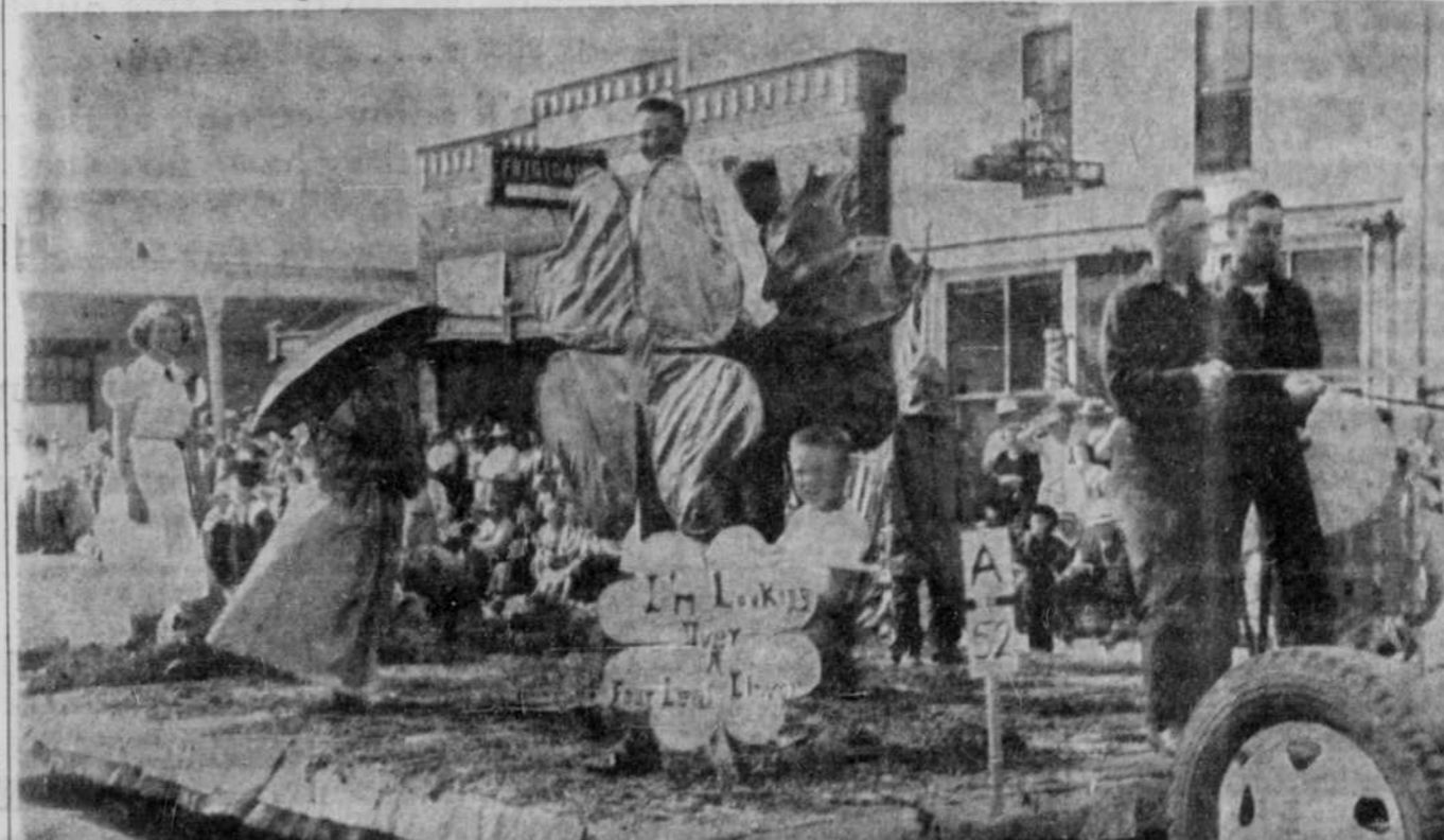
Winner in 4-H Division . . . "I'm Looking Over" . . . by Clover Club.