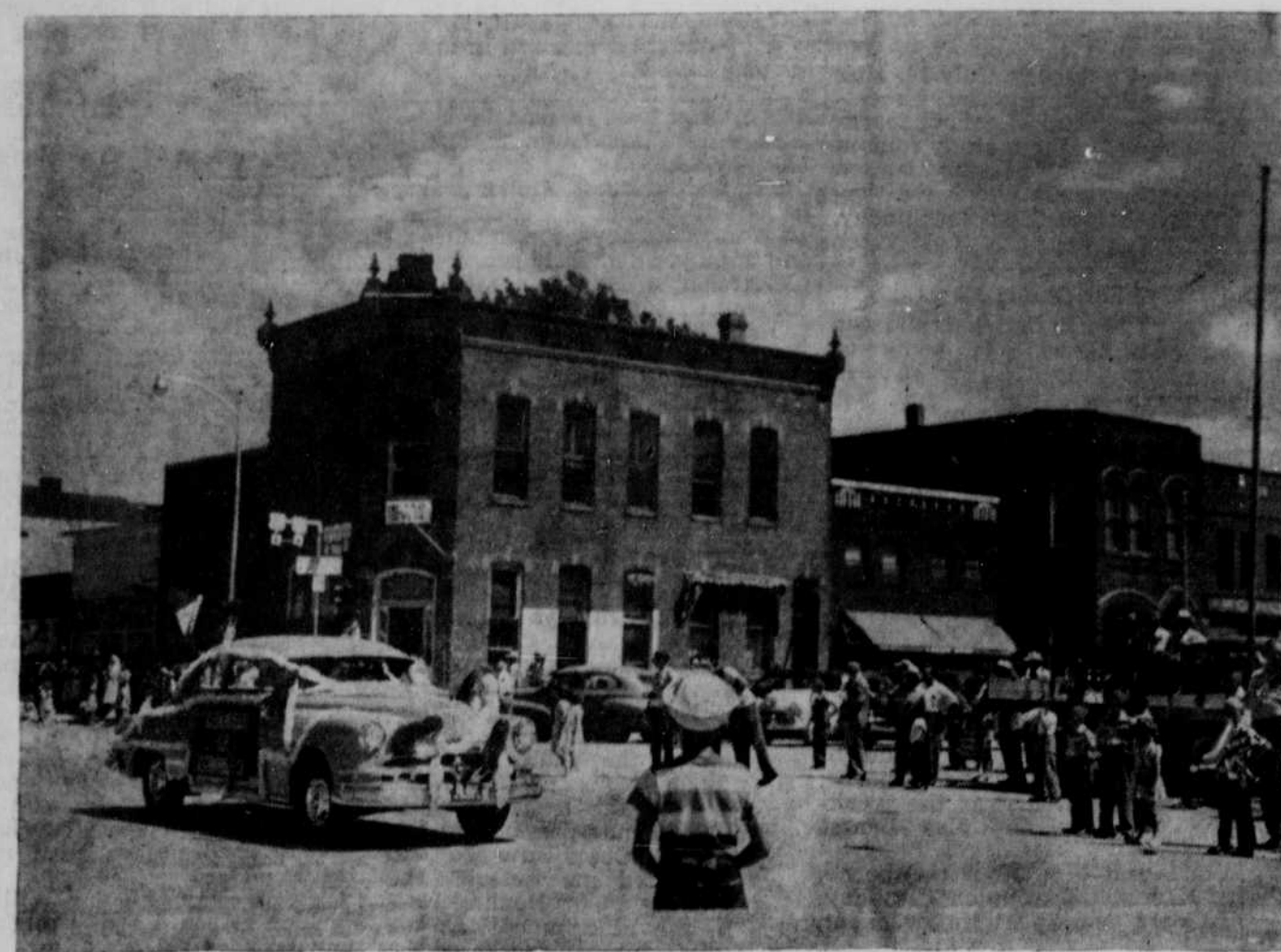
'VOICE' BROADCASTS DESCRIPTIVE . . The "Voice of The Frontier" special events unit provided a special direct-wire report of the parade from the office of Thomas Nolan, 2d floor, Hagensick building (note banner hanging from corner overlooking O'Neill's main intersection).

George Hammond presented the word-picture in the 30-minute broadcast, over radio station WJAG, beginning at 2 p.m. Before leaving the air at 2:30 he was able to announce the parade winners to the radio audience.