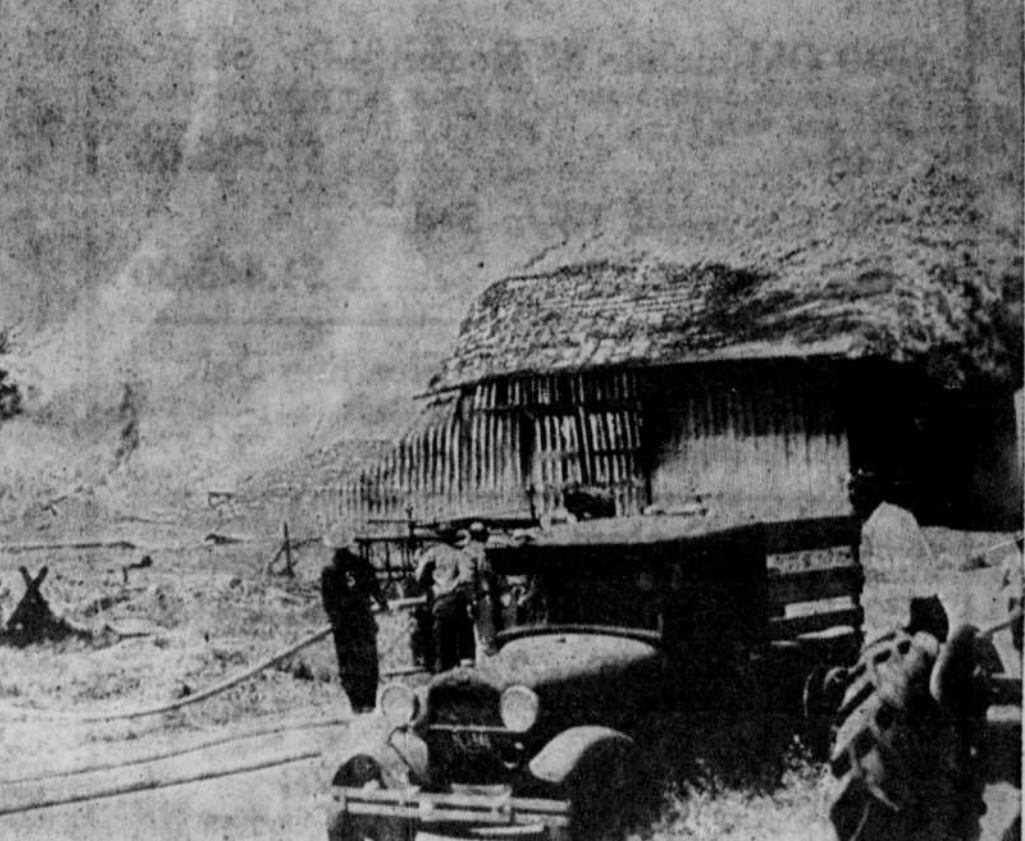
BUILT IN 1924... The 125 x 60-ft. barn was built in 1924 by Bigelow & Farmer. Total loss was estimated in excess of $20,000. All of the contents were completely destroyed. Within a few seconds after the above picture was taken the barn had collapsed.—The Frontier Engraving.