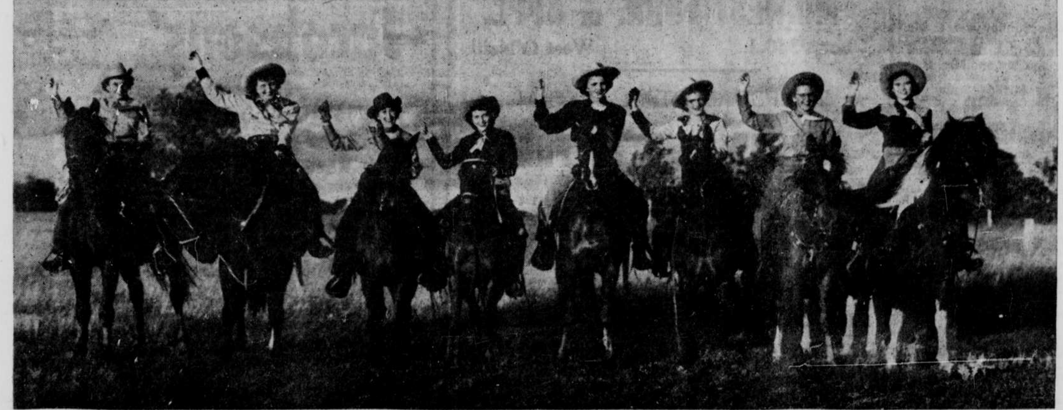
TOUGH JOB FOR JUDGES . . . The judges of the beauty contest in connection with the annual 2-day rodeo and Fourth celebration at Stuart had distinct problems in selecting a queen from this bevy of beauties astride