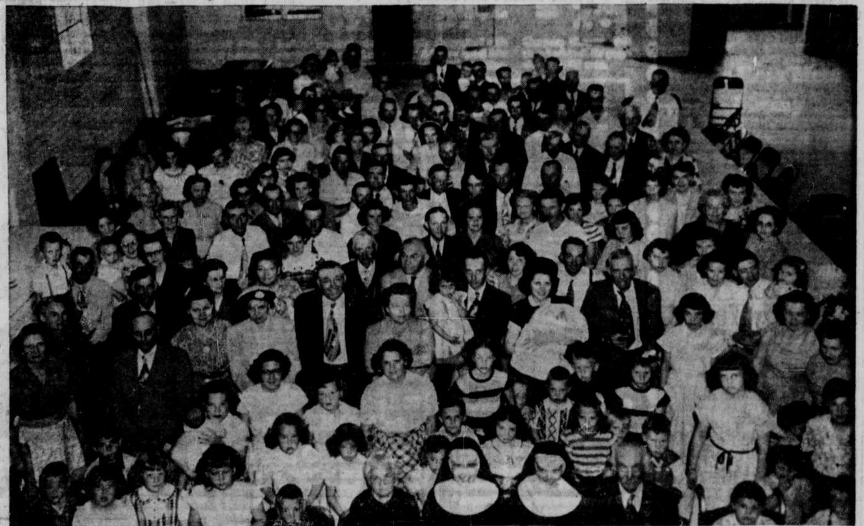
A portion of the 200 persons who attended the biennial Bahl family reunion are shown (above) gathered in the Knights of Columbus hall in Atkinson. There were 179 members of the family and 21 guests registered. (More Bahl reunion pictures on page 11.)