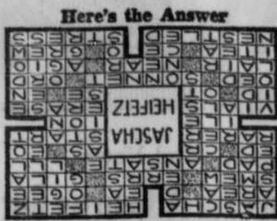
Here's the Answer

VERTICAL 1 Man's name 2 Fleet 3 Plant 4 Crow's cry 5 Arabian gulf 6 Wife of Zeus (myth.) 7 Direction 8 Mist 9 Brother of Volund (myth.) 10 Relater 11 Enthusiast 17 Rupees (ab.) 20 Takes into custody 21 Most facile 24 Musical instrument 26 Shop 29 Narrow inlet 31 Collection of sayings 34 He plays the