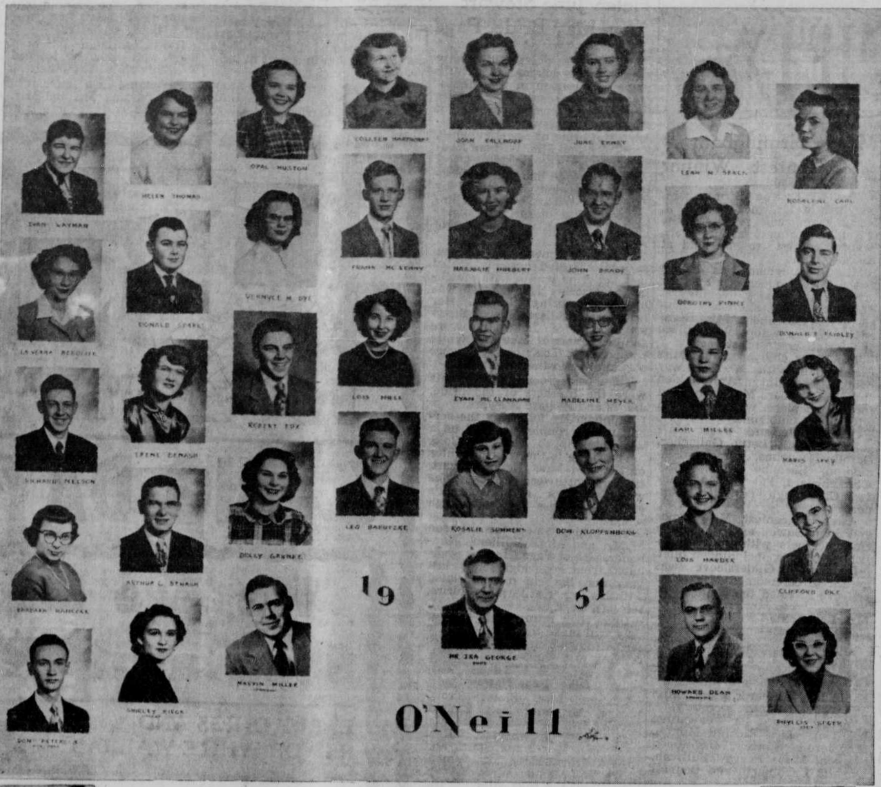
37 O'Neill High Seniors

If you are going on a vacation, let bricks take care of your plants. Put as many bricks on the bottom of a tin tub as you have plants. Cover the bricks with water and stand a plant on each. The bricks will absorb enough water to keep plants in good condition for some time.