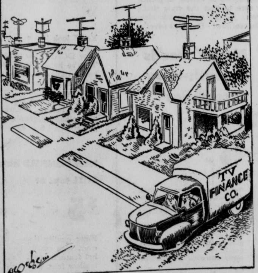
"We'll turn right, drive slowly and worry the folks on this street!"