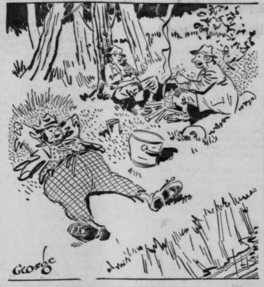
"Charlie over there says he contributes to the war effort by keeping out of everybody's way."