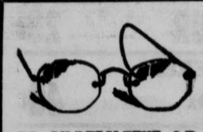
OPTOMETRIST Permanent Offices In Hagensick Building Phone 167 O'NEILL NEBR. vas Examined . Glasses Fitted

milk or cream and cook to a nearly cold pour into mold and smooth sauce, stirring constant-ly. Add chicken to sauce and season with salt. Heat the mixture