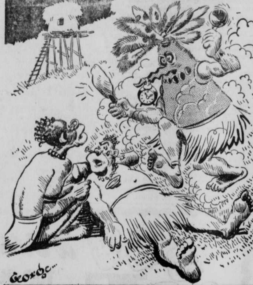
"I've just gotta get a different doctor; feathers aggravate my hay fever!"