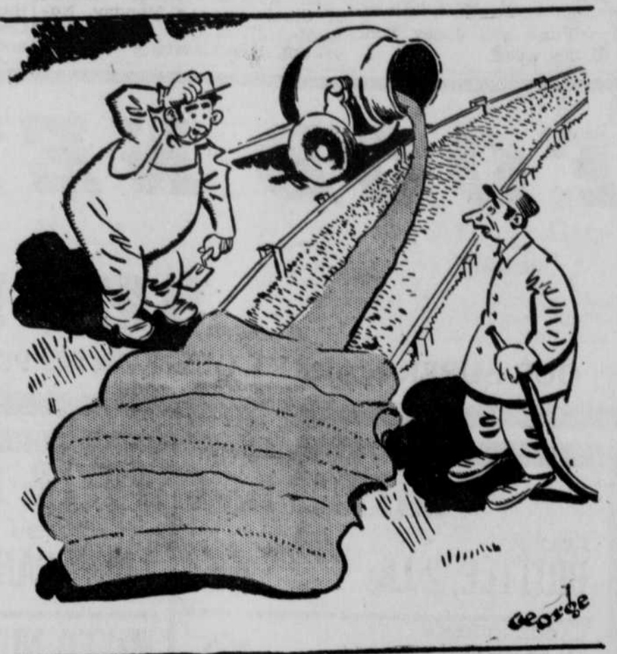
"Do you think maybe we put too much water in our concrete?"