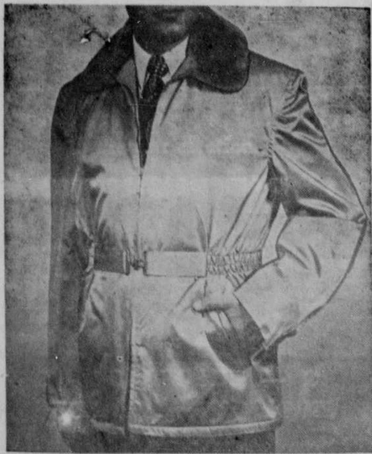
Handsome all-weather coats with mouton collars

Men! Boys! Buy of the year! Warm jackets, quilted-lined