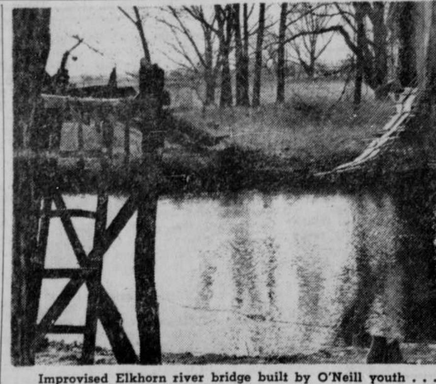
Improvised Elkhorn river bridge built by O'Neill youth . . . stood test of 20 persons.