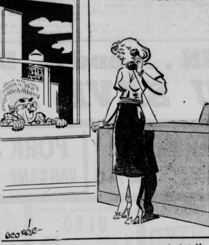
"The Acme Collection Agency? I'm sorry, sir, but Mr. Layne is not in his office at the moment!"