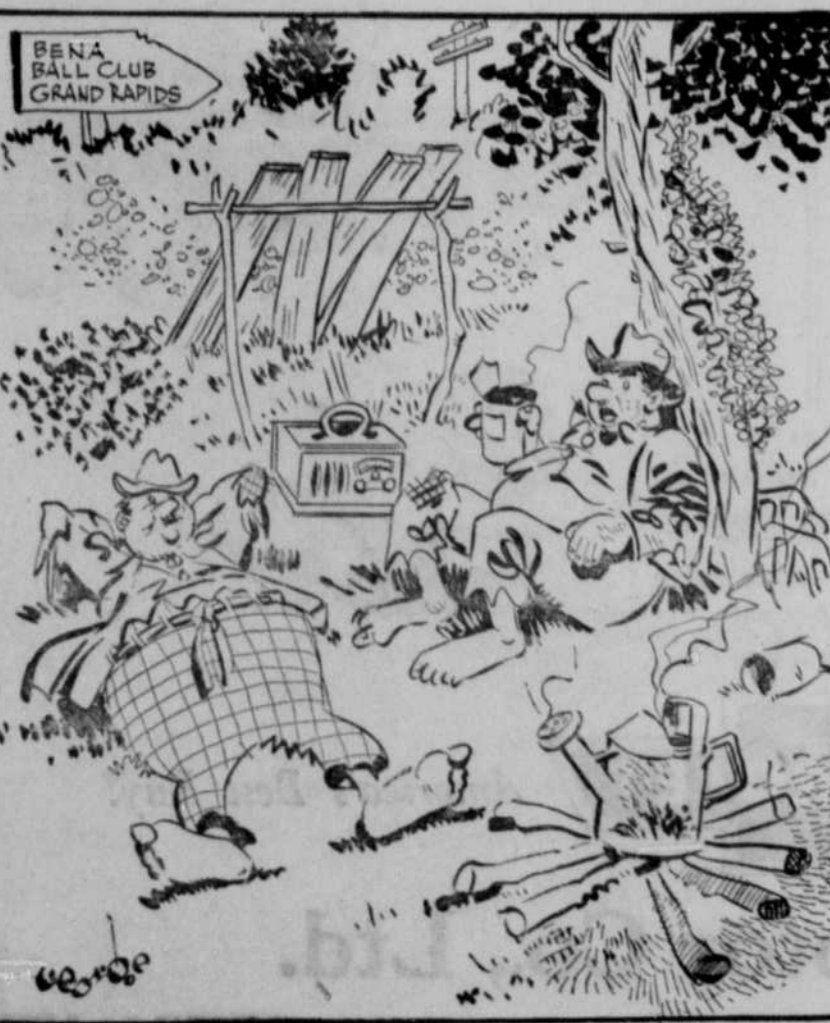
"I'll tell you what's wrong with the American people—too many modern conveniences are making us soft!"