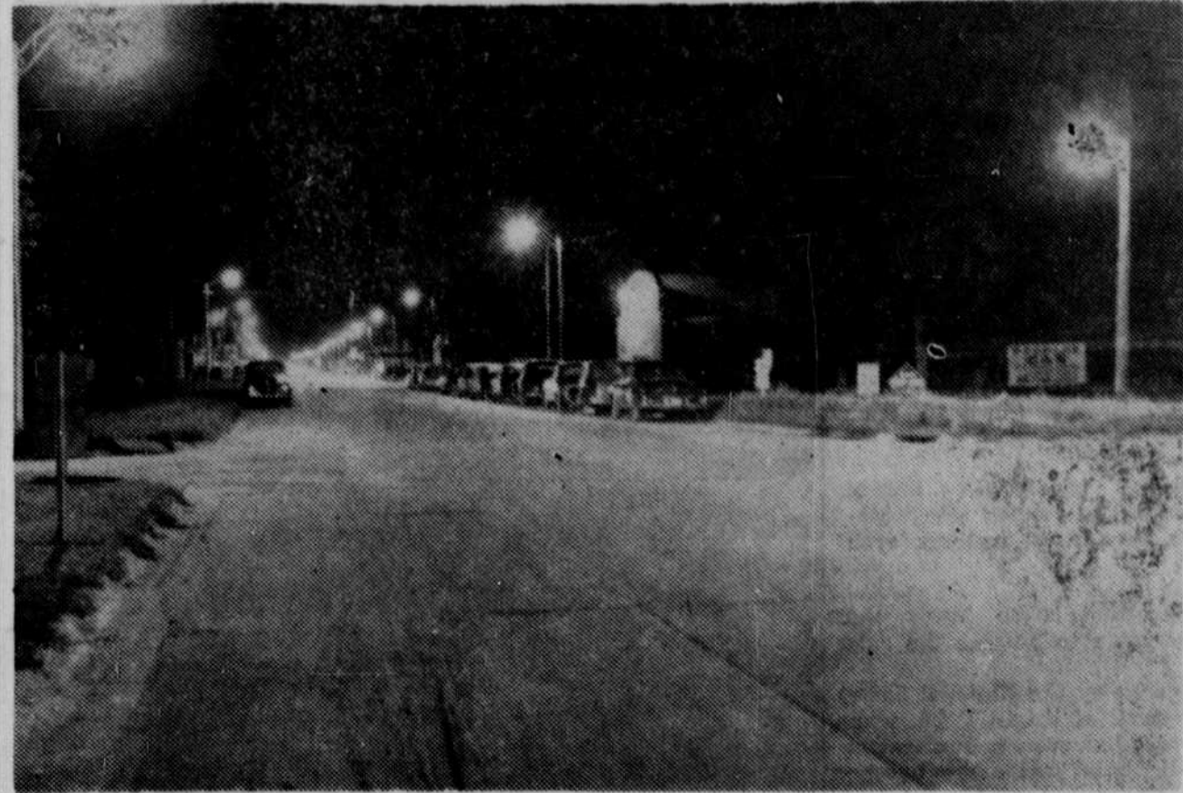
O'Neill's new white way (above) provided sharp contrast with old street-lighting system (below). Both photographs were taken from the same spot at corner of Seventh and Douglas streets. Note highway marker in lower left-hand corner of both pictures; also note how signs loom under new arcs. The new white way was energized at 10 o'clock Saturday night while the city was host to thousands of visitors. Old standards have been sold and are being removed.