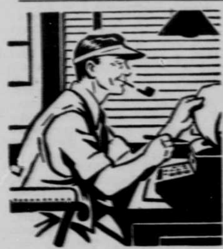
State Editors Meeting This Month