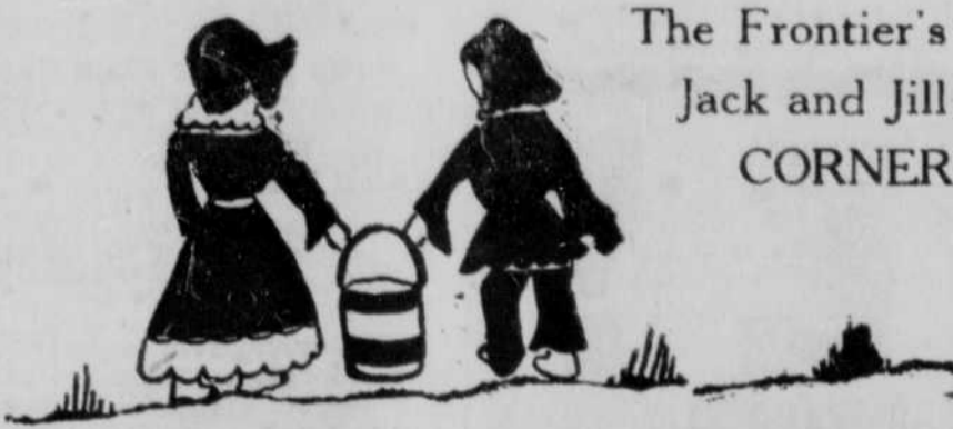
The Frontier's Jack and Jill CORNER