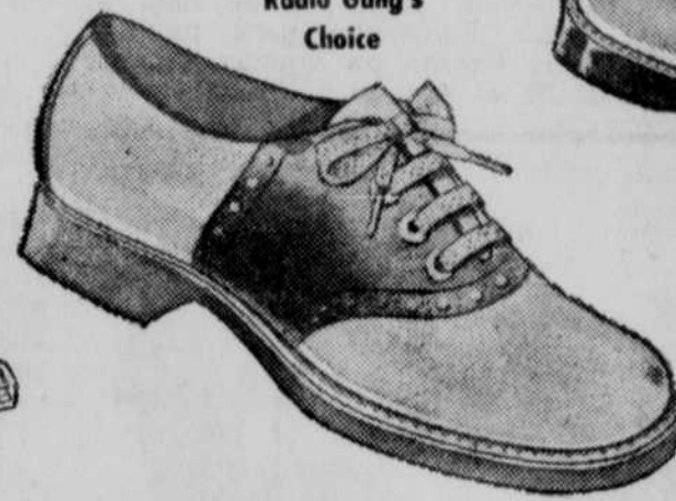
Radio Gang's Choice