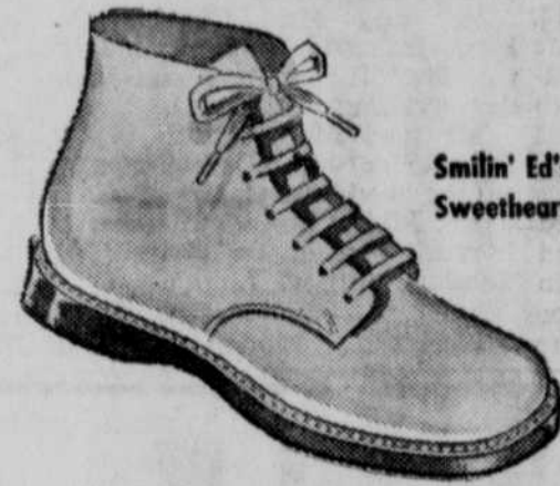
Smilin' Ed's Sweetheart