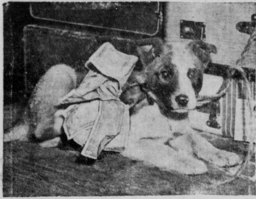
HOMELESS BUT LOADED . . . Homeless but loaded with dough, a little brown and white puppy of undertermined breed waits patiently for his master to reclaim him after being abandoned in a Chicago, Ill., depot. Apparently conscience-stricken, the owner left nine dollar bills tied around the pup's neck.