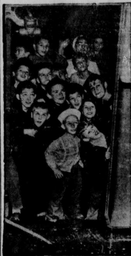
HOT ZIGGETY! . . . All these happy faces peering through the door of the Kemble school in Utica, N. Y., could mean but one thing—the school house caught fire. It didn't burn down, but fire damaged a big part of the roof, and so school was out temporarily. What could be nicer!