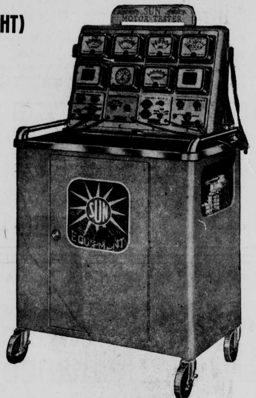
SUN TESTING EQUIPMENT

Nothing escapes the uncanny, perfect "eyes" and "ears" of the motor analyzer. It checks the compression, vacuum, generator, starter, carburetor, battery, and the entire electrical system.