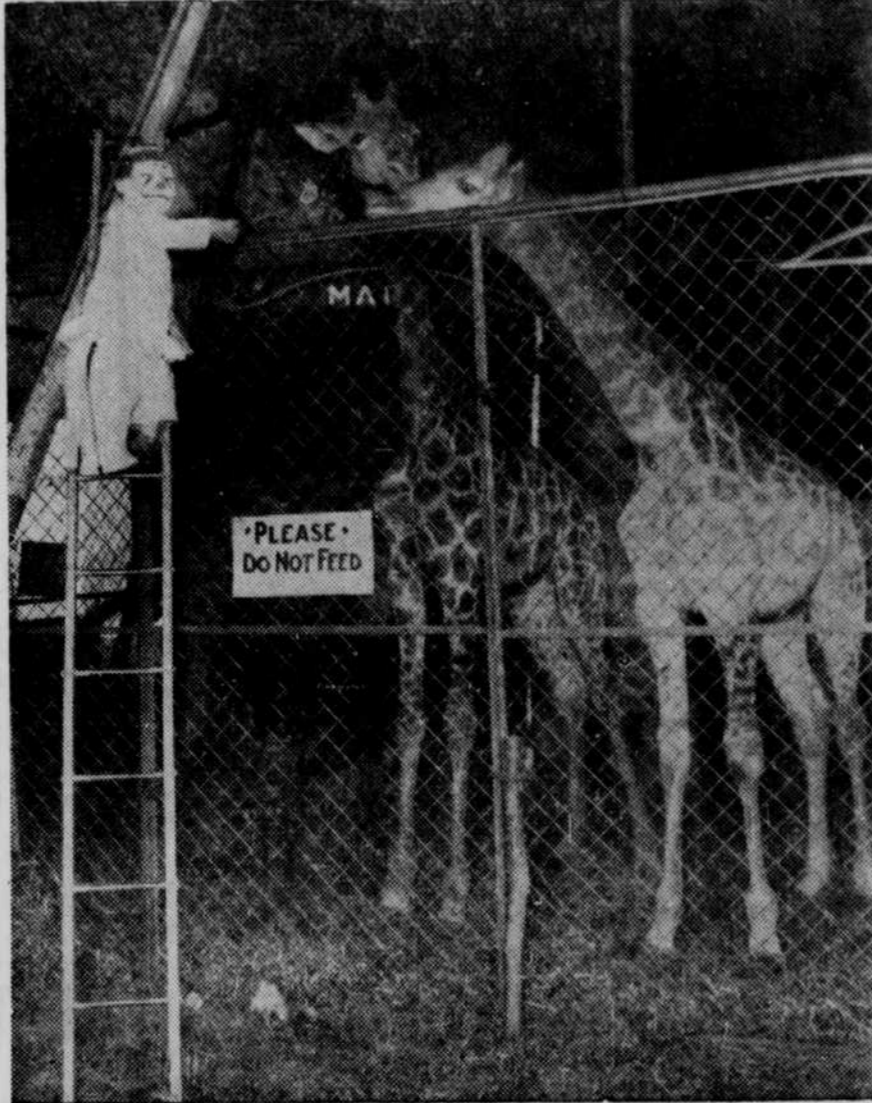
A midget clown with the Kelly-Miller show offers a height comparison with 2 of the giraffes, which are recent additions to the circus. (See story at left.)