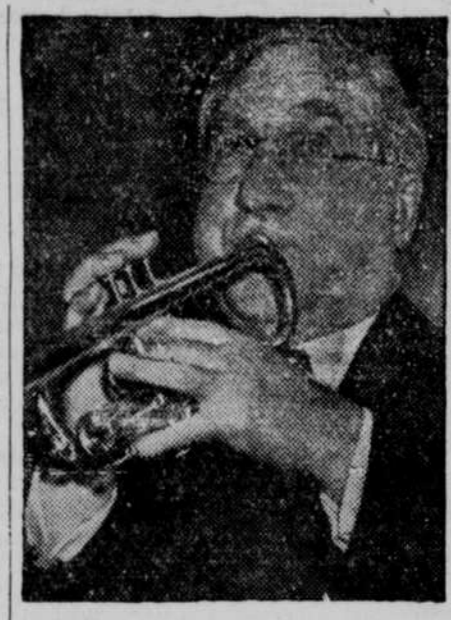
MUSIC . . . James Caesar Petrillo, president of American Federation of Musicians, was first participating musician under agreement between AFM and radio networks which provides that television will feature "live" music.