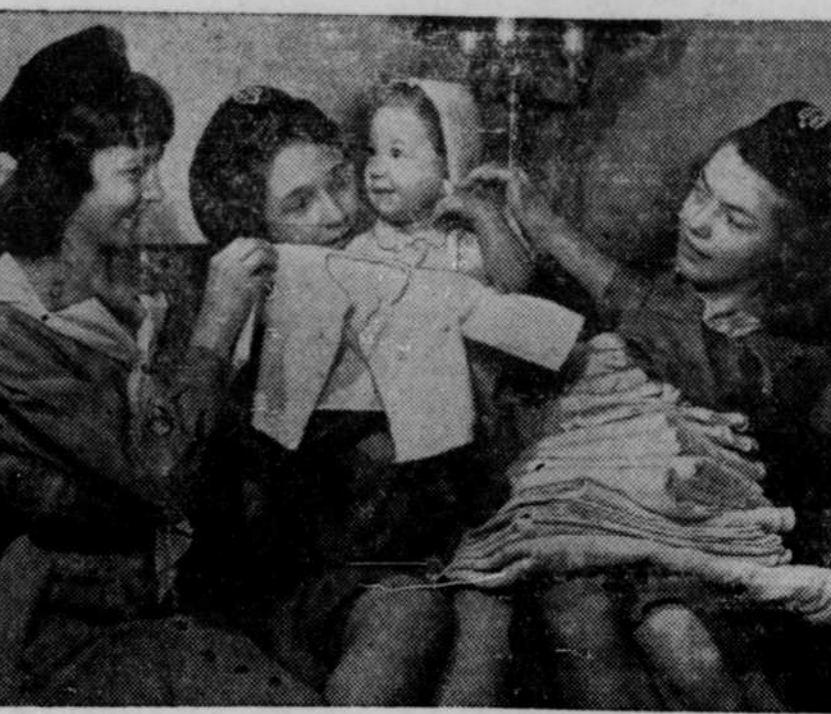
TRYING IT ON FOR SIZE . . . America's girl scouts are broadminded. They believe that even a baby can do something to help the destitute people of the world. Currently, the girl scouts are engaged in assembling clothing kits to go to children in Europe and Asia. This Toledo, O., troop borrowed its leader's baby to model the baby garments they made as their contribution to the effort to make a million garments during 1948.