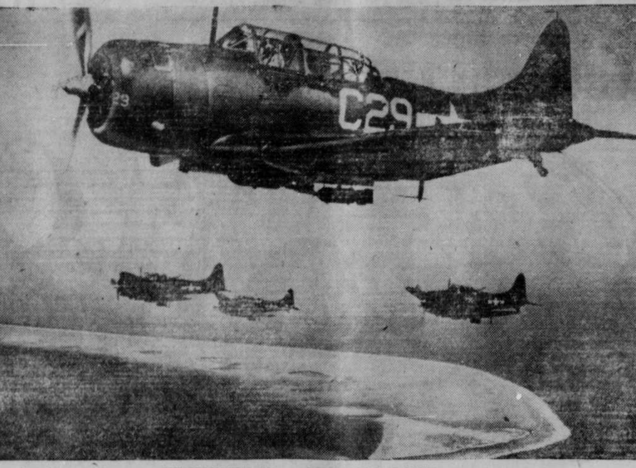
ENIWETOK — ATOMIC BASE

Members and their guests are invited to visit the Old Plantation Club.