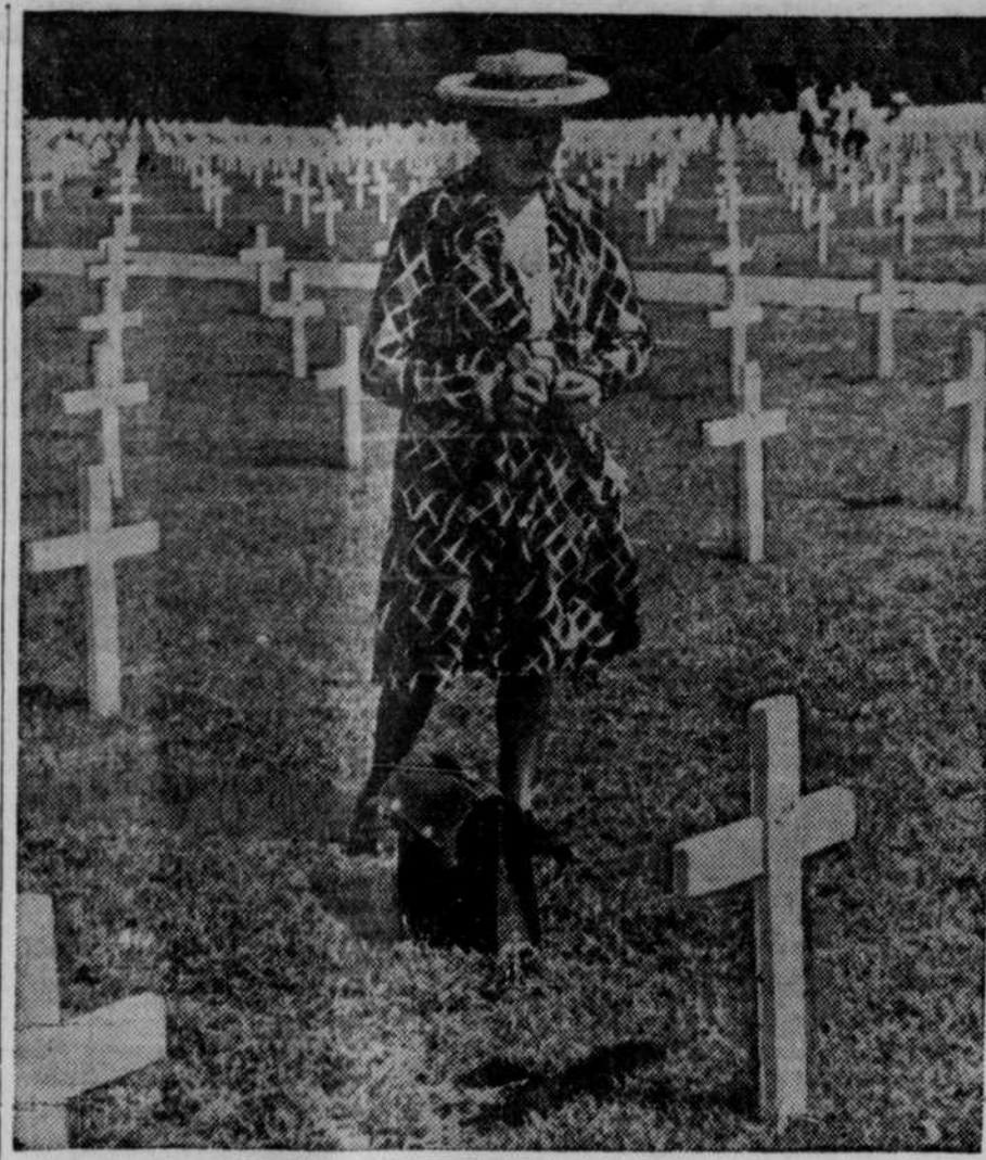
PRAYER AMONG THE CROSSES

Because thou hast made the Lord . . . even the Most High thy habitation, there shall no evil befall thee, neither shall any plague come nigh dwelling.—Ps. 91:9-10.