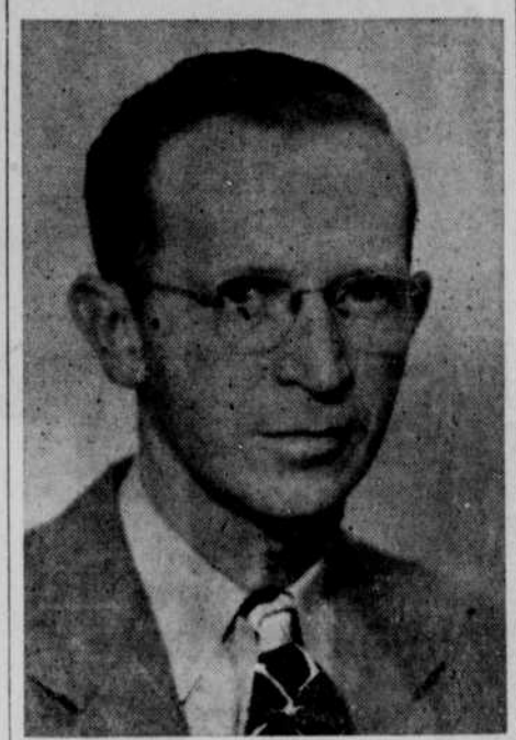
of O'N il . . . mainfloor man-