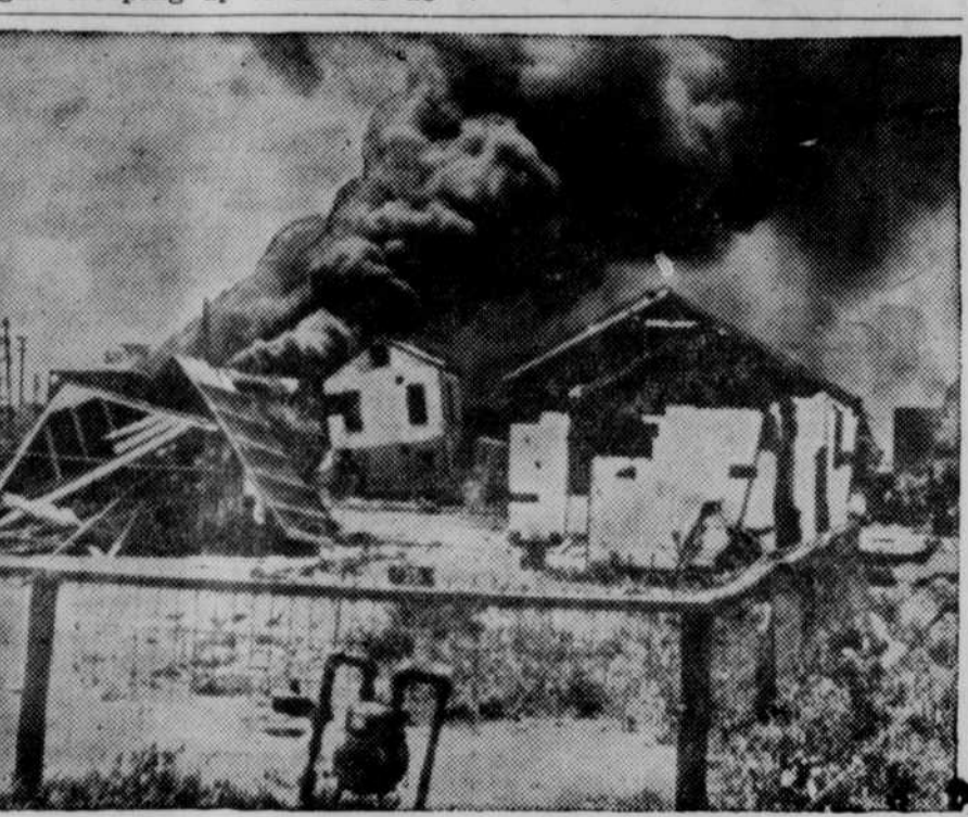
MANY LEFT HOMELESS

It will be weeks before the | total casualty list is definitely compiled in the recent Texas When Tex., disaster. the fire and explosion wreck-