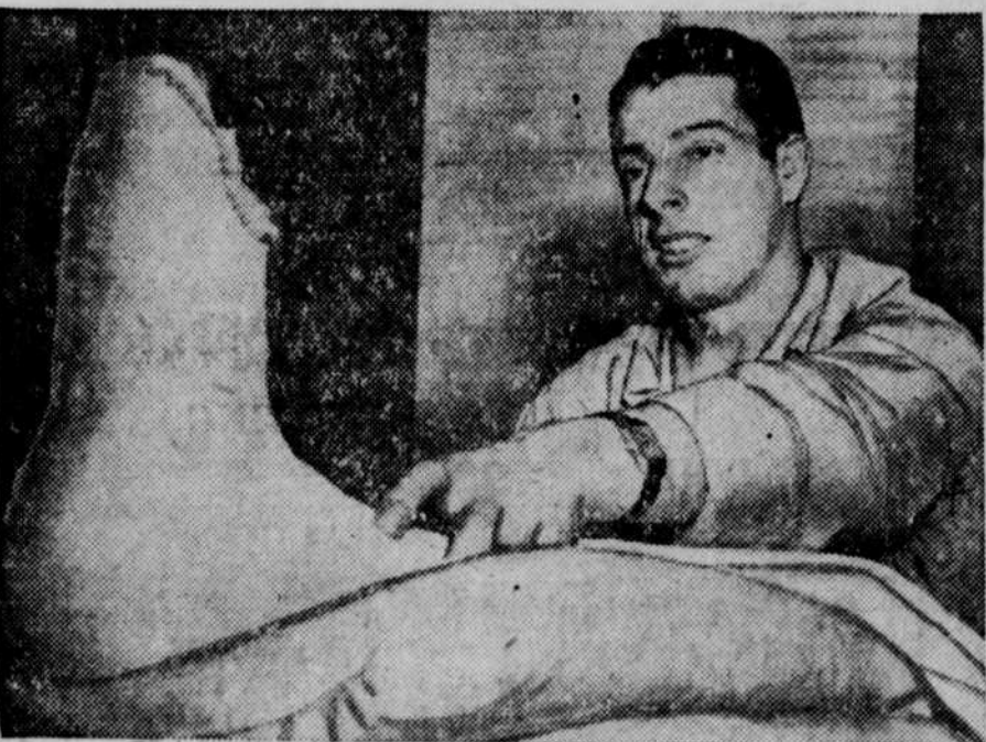
DI MAG FEELING FINE AFTER SURGERY . . . Joe Di Maggio, New York Yankee infielder, is shown in New York hospital, looking at his cast-bound foot following the removal of a calcium growth. A bursa condition found in Joe's heel was also cleared up. His doctor reports that Joe should be able to play as well as he ever did. Di Maggio says that he thinks he can break the record set during the last baseball season and will be in better shape after operation