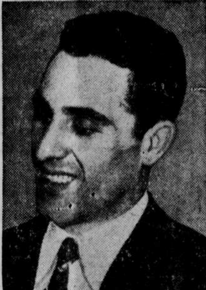
OUTSTANDING PLAYER . . . Charley Trippi, star fullback of Georgia university, who has been awarded the Robert W. Maxwell Memorial trophy as the outstanding football player of 1946.