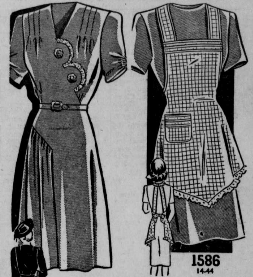
1589 32-46 1586 14-44 Practical Bib Apron

YOU'LL need very little fabric for this pretty and oh so practical bib apron. It requires just one yard of colorful material in the smaller sizes. Three rows of bright braid finish the bodice top and nice sized pocket. Pattern No. 1586 is designed for sizes 14, 16, 18, 20, 42 and 44. Size 16, one yard of 35 or 35-inch; 6 yards binding. Send your order to: SEWING CIRCLE PATTERN DEPT. 530 South Wells St. Chicago 7, Ill. Enclose 25 cents in coins for each pattern desired. Pattern No. _____ Size _____ Name _____ Address _____ Pattern No. 1589 comes in sizes 32, 34, 36, 38, 40, 42, 44 and 46. Size 34, 4 1/2 yards of 35-inch fabric; 1/2 yard purchased ruffing.