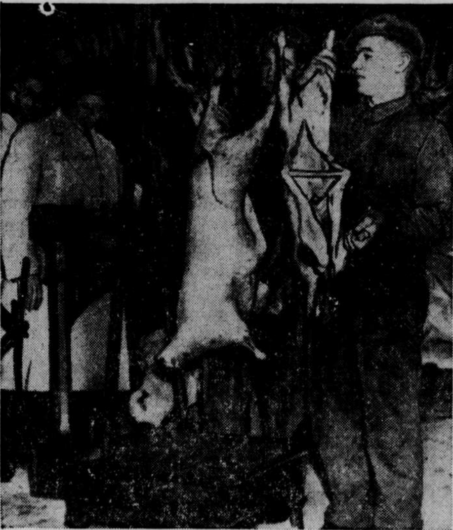
BRITISH TROOPS DELIVER FOOD . . . Soldiers in fatigue uniforms handle carcasses of meat at London's famed Smithfield market after the government sent troops to take over deliveries of meat to insure essential supplies of food for the public. The transport strike tied up all deliveries of food. Following the employment of troops matters became worse, for a rash of sympathy strikes broke out all over England.