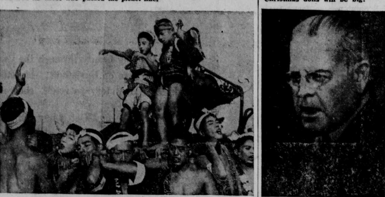
ANSWERS MOLOTOV . . . Warren R. Austin, chief U. S. delegate to the U. N. general assembly, has taken the lead in answering Russia's foreign minister, Molotov, on plans to police atomic energy and other issues.