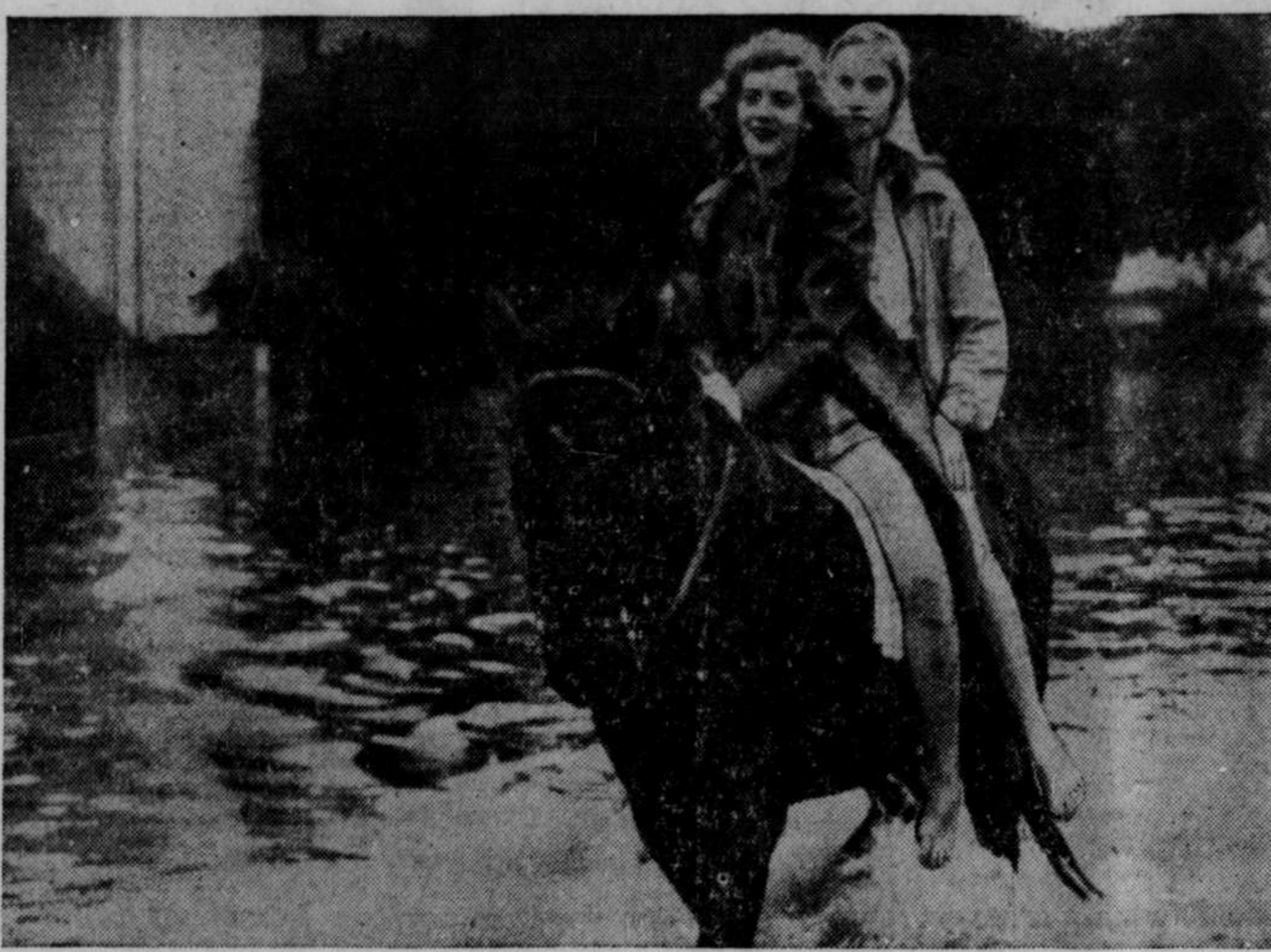
CLOUDBURST HITS TEXAS TOWN . . . Two young women of Beaumont, Texas, were forced to leave their flooded homes on the back of their pet pony. A cloudburst covered a large portion of the city with water ranging from several feet to inches deep. Most of the water receded within four days.

ARE YOU PALE WEAK, TIRED due to MONTHLY LOSSES? You girls and women who lose so much during monthly periods that you're pale, weak, "dragged out"—this may be due to lack of blood-iron. So try Lydia E. Pinkham's TABLETS—one of the best home ways to build up red blood—in such cases Pinkham's Tablets are one of the best blood-iron tonics you can buy!