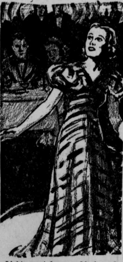
Lights went down suddenly and a girl stepped into the yellow oval of a spot.

The desk light was on in the outer light it threw lay a note from Ann