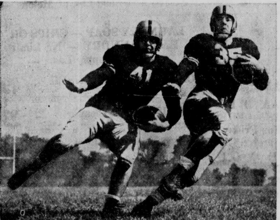
DAVIS AND BLANCHARD AGAIN . . . The Army's touchdown twins, Glen Davis, left, and "Doc" Blanchard, demonstrate how they plan to shake the opposition during the coming football season. They were snapped during practice at the United States military academy, West Point.