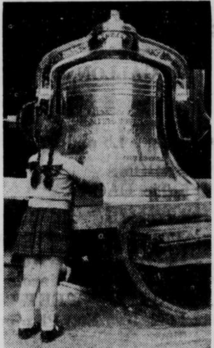
BELL TO HONOR HERO . . . A pig-tailed little girl is reading the inscription on the bell whose tolling will be a ringing memorial to the late Gen. George S. Patton, former commander of the U. S. 3rd Army. It was presented to St. John's Episcopal church, Beverly Farms, Mass.