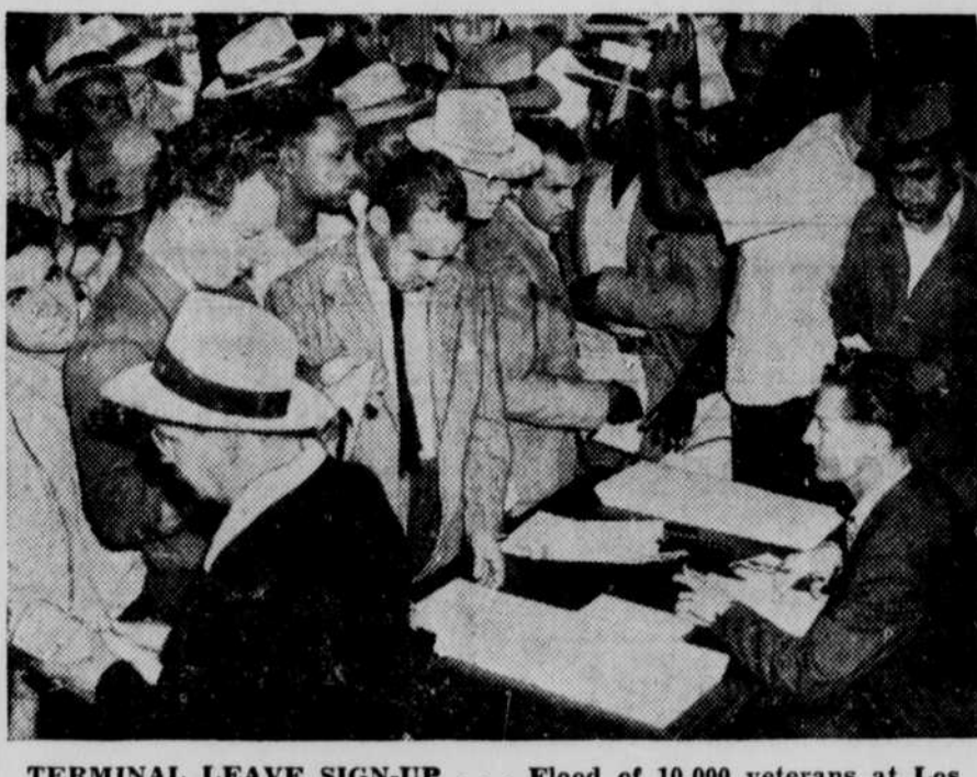
TERMINAL LEAVE SIGN-UP . . . Flood of 10,000 veterans at Los Angeles office to obtain the first terminal leave forms available in Southern California is shown in above photograph. This rush was typical of that to be found in nearly every city in the United States. The forms were printed locally through special arrangement with the war department, and are identical with those issued by the government. Bonds will be issued for amount of pay due.