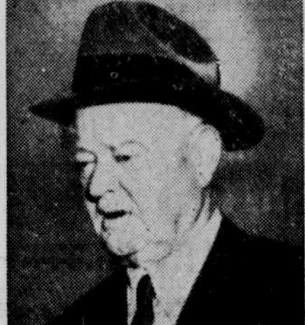
STOP RELIEF! . . . World War I food czar, ex-President Herbert Hoover, as he called for an immediate stoppage of relief supplies to Yugoslavia. He termed that nation's shooting down of American planes, "a poor token of gratitude."