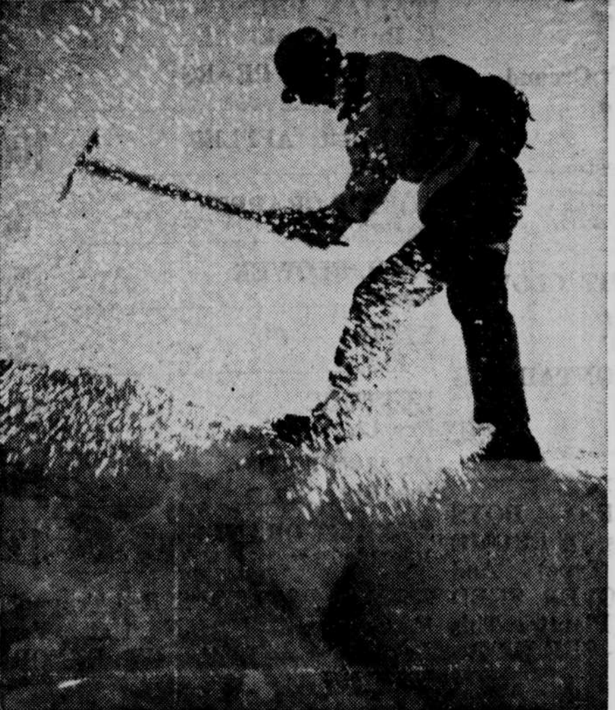
ADVENTUROUS? GO CLIMB AN ALP! . . . But you won't have to go to Switzerland to do a spot of Alpinering. Mountaineers from all parts of the United States and Canada do it in the Canadian Rockies, and they say the thrills are worth all the efforts. The Bugaboo glacier in the Purcell range of British Columbia is tougher than many Swiss Alps and unmatched in grandeur. Here is Maj. Rex Gibson, one of Canada's ace Alpinists, chopping footholds.