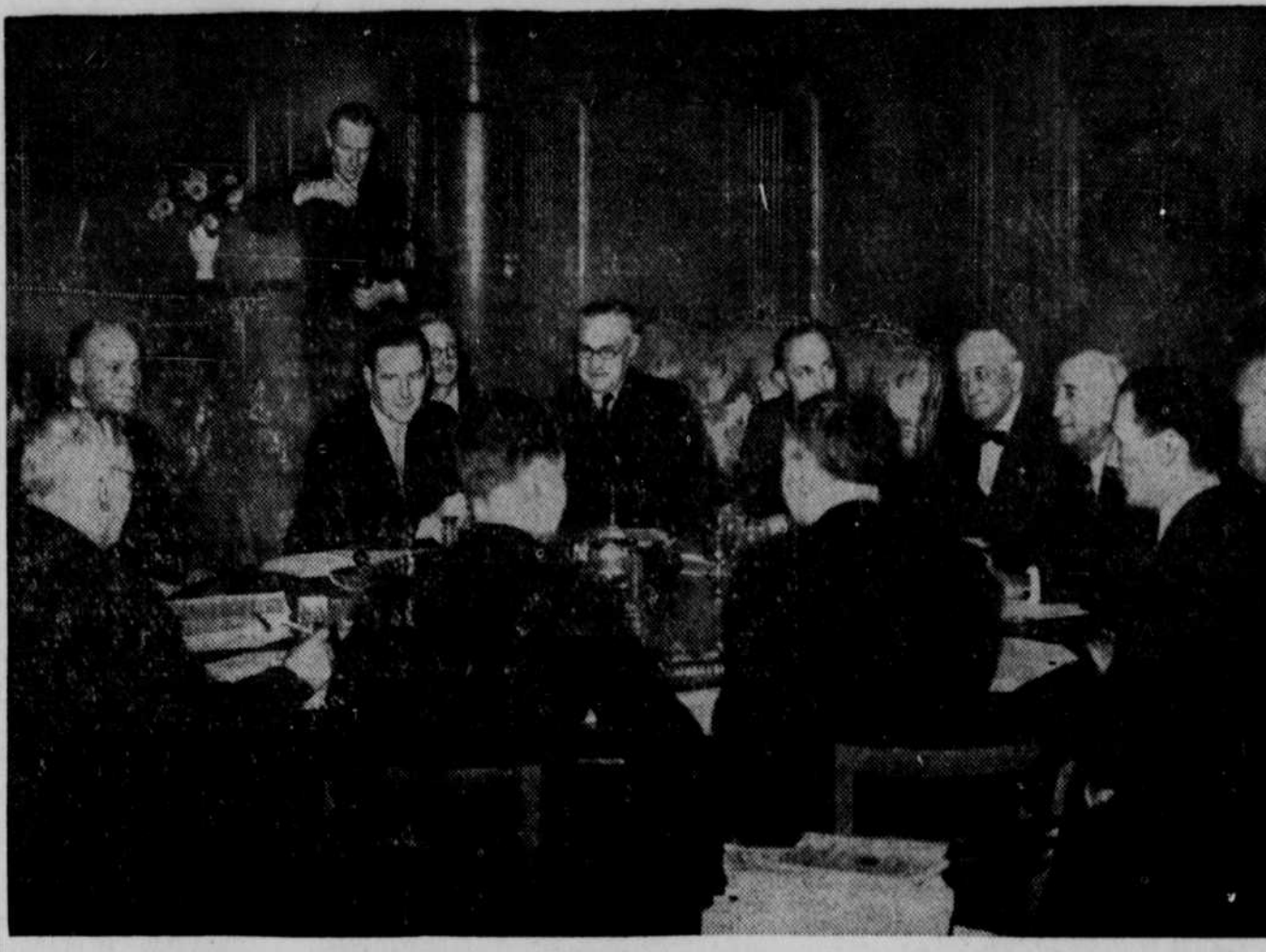
BIG FOUR AT PARIS CONFERENCE . . . During the Paris peace conference, representatives of the Big Four hold special sessions to determine policies. French Premier Georges Bidault serves as host to representatives of the United States, Russia and Great Britain. Sen. Tom Connally, Sec. of State James F. Byrnes and Sen. Arthur H. Vandenberg are shown at extreme right.