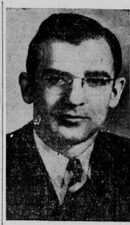
BROKE LA FOLLETTE TRADI-TION . . . For the first time in 40 years, a La Follette will not be a member of the U.S. senate at next session. This was assured by the defeat of Sen. Robert La Follette by Joseph R. Mc-Carthy, for the Republican nomination. La Follette had recently rejoined the Republican party.