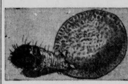
Coddling moth in apples.

Present drawback seems to be that in some cases rather severe infestation of red spider in the apple