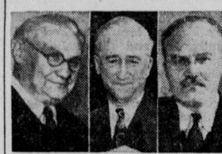
Bevin, Byrnes and Molotov.

clusion of terms, their deputy foreign ministers who had foundered over a majority of the issues happily advanced a solution to the Trieste problem: Agreeing to settle territorial claims on the basis of residential nationalities, the deputies recommended Italy's retention of Italian-populated Trieste and surrender to Yugoslavia of Yugoslavian-settled land nearby the vital port.