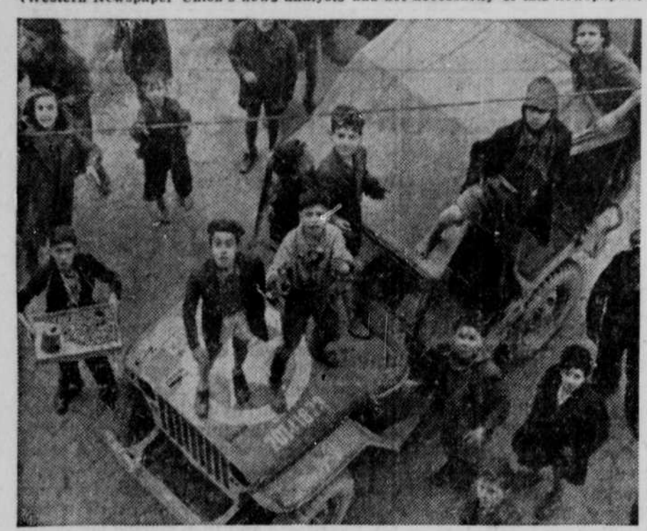
Pointing up Herbert Hoover's statement that 30 million European shildren are in need of extra food, these Italian youngsters beg photographer for bread. Boy at left tries to sell peanuts to obtain money for purchasing cereals.

Released by Western Newspaper Union ._ (EDITOR'S NOTE: When opinions are expressed in these columns, they are those of (Western Nowspaper Union's news analysis and not necessarily of this newspaper.)