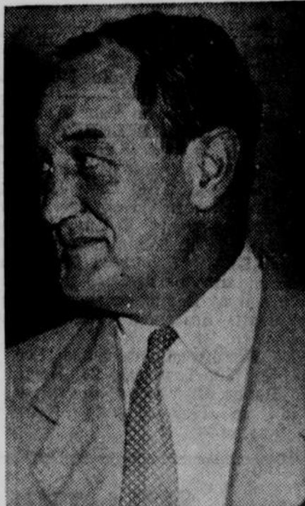
PAULEY WITHDRAWS . . . The nomination of Edwin W. Pauley, Beverly Hills, Calif., as undersecretary of navy, was withdrawn by President Truman, when it became apparent that the oil man's nomination would be rejected.