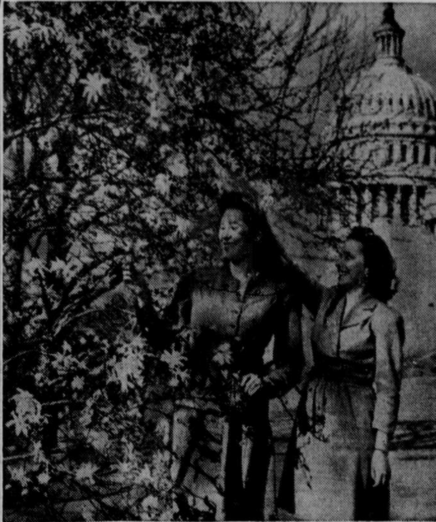
BLOSSOM TIME ARRIVES IN WASHINGTON . . . While many parts of the nation were still covered with snow, blossom time came to Washington. For years one of the show features of the national capital has been the blanket of blossoms from the thousands of trees on government grounds.