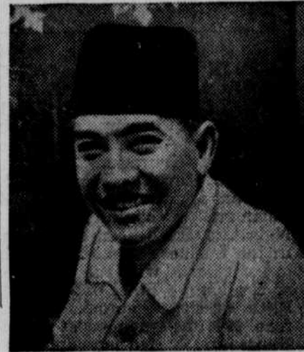
INDONESIAN PRESIDENT . . . Although Dr. I. R. Soekarno served under the Japanese occupation, he has managed to retain his authority over the 80,000,000 Indonesians. He is nationalist leader as well as president.