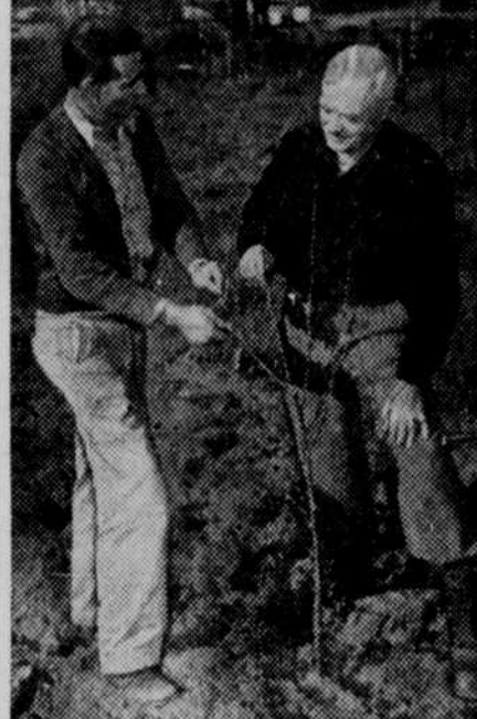
FARMER GENERAL ARNOLD . . . It's a farmer's life for Gen. Henry H. ("Hap") Arnold, retired chief of the army air forces, who is shown at home on his ranch near Sonoma, Calif. His nurseryman served under "Hap."