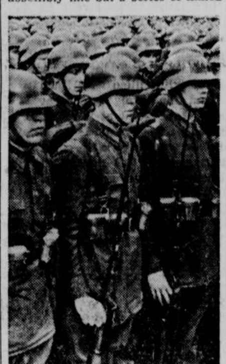
Reviews Red Army

Now we tour the plant. Again it seems to have no smooth-running assembly line but a series of linked