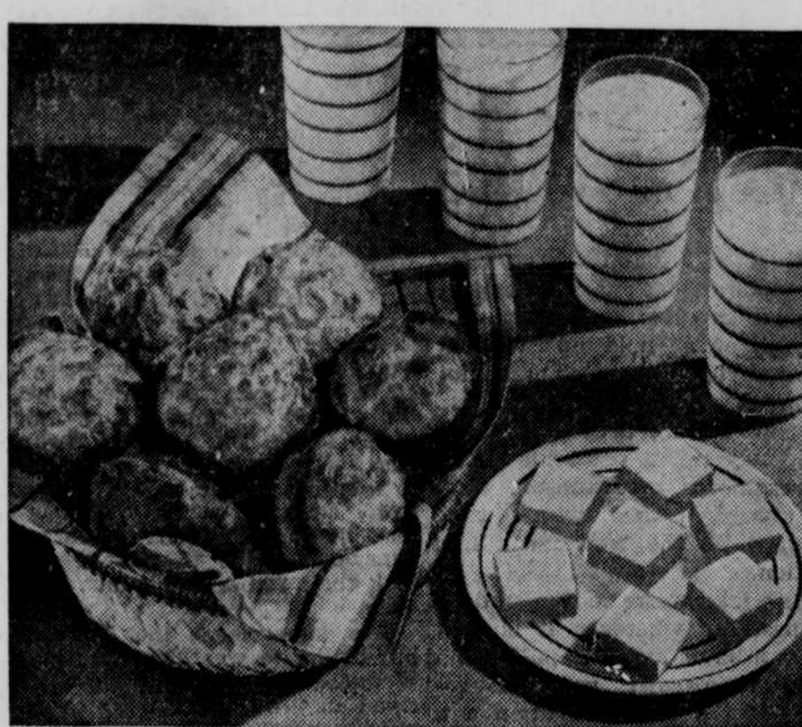
Follow Rules for Melt-in-Your-Mouth Muffins (See Recipes Below)