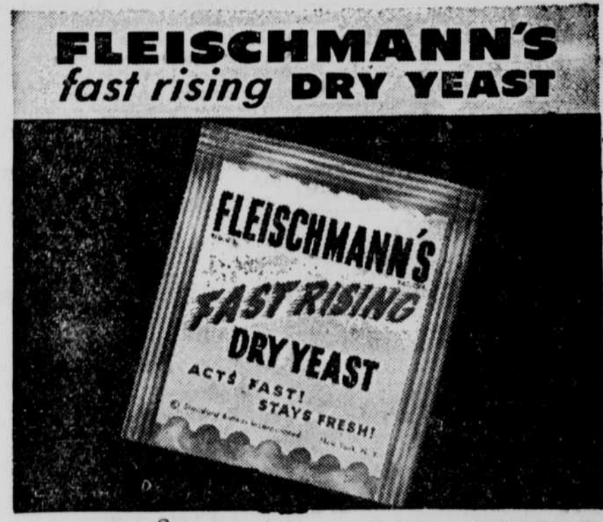
As easy-to-use . . . as fast acting as ever, Fleischmann's Fast Rising stays fresh for weeks on your pantry shelf-ready for quick use. Ask for Fleischmann's Fast Rising Dry Yeast. At your grocer's.

Now-honorably discharged-Fleischmann's Fast Rising Dry Yeast is back to serve in your kitchen as it served in field kitchens abroad. IF YOU BAKE AT HOME-Fleischmann's Fast Rising Dry Yeast will help you make better bread in just a few hours.