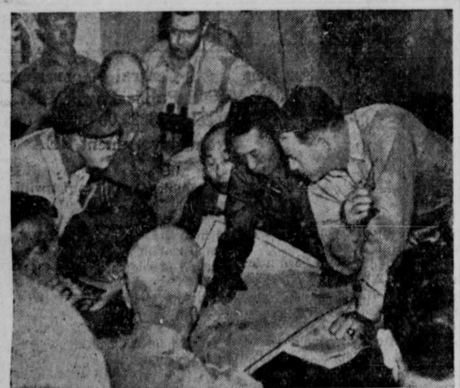
In conference aboard USS Missouri, Jap navy officers chart Tokyo bay for Admiral Halsey's staff preparatory to American fleet's triumphant entry as part of General MacArthur's occupation force.

(EDITOR'S NOTE: When opinions are expressed in these columns, they are those of Western Newspaper Union's news analysts and not necessarily of this newspaper.)