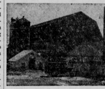
Paint adds to life of building.

The average farmer does not repaint his service buildings oftener